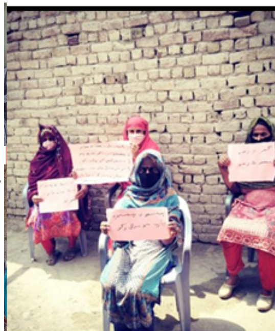
We are united to fight against this pandemic COVID-19

In continuation of awareness, SRSO staff and Cis leaders arranged different awareness sessions, demo of different preventive measures i.e. hand washing, usage of mask and hand sanitizer usage and social distancing during their routine life. The Cis were provided the IEC material in local languages.