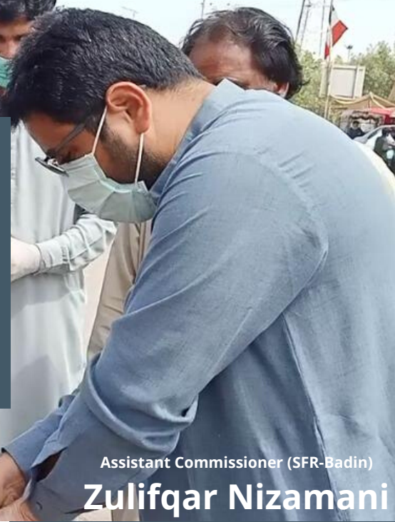
Assistant Commissioner (SFR-Badin)

Promoting Hand Hygiene at community level