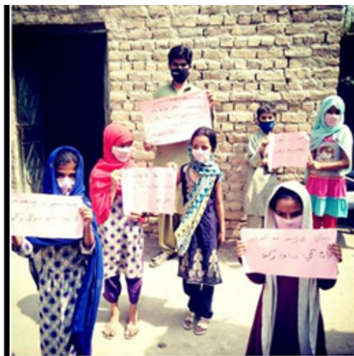
We are following precautionary measures because our little efforts can save our lives