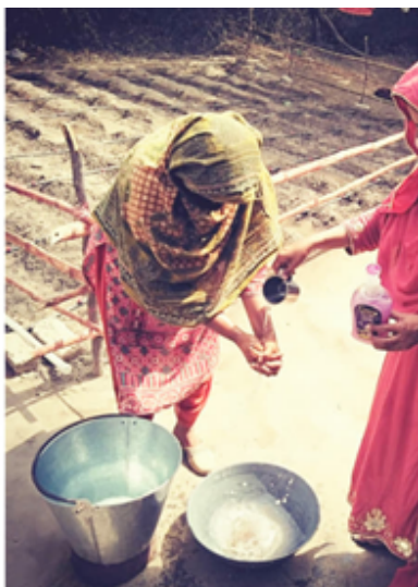
We are frequently washing our hands before and after any work