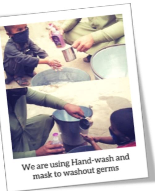
We are using Hand-wash and mask to washout germs